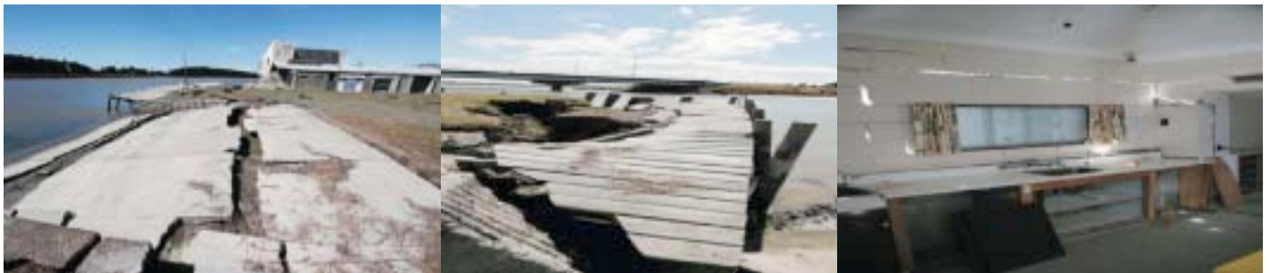
Pleasant Point Yacht Club (New Zealand)

The IOBG Humanitarian Foundation, a 501 c 3 Organization, incorporated in the State of California. You can write a check to the IOBG - Humanitarian Foundation and put in the memo field NZ Support Efforts.