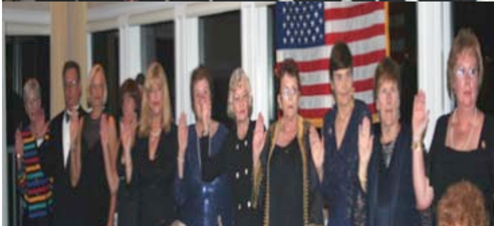
Annual Meeting Long Beach Island, NJ