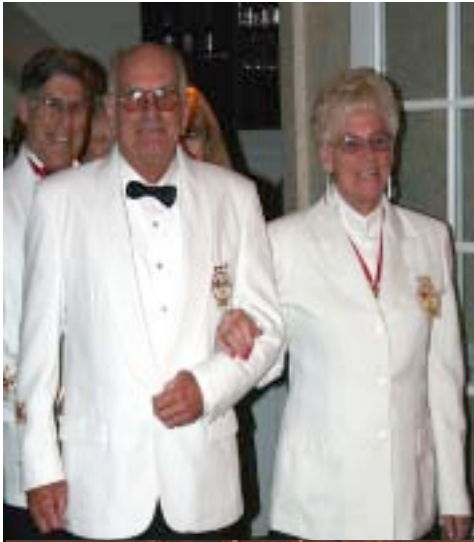
District #1 comes to Long Beach Island, New Jersey